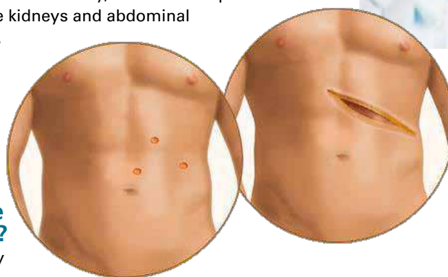
Figure 3. Patient with laparoscopic incisions compared to conventional open kidney surgery scar.

Laparoscopic radical nephrectomy is usually performed for patients with moderate to large kidney cancers (> 4cm in size). Such patients will