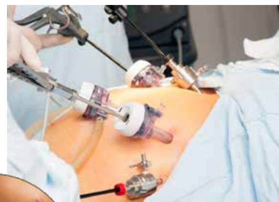
Figure 2. Laparoscopic kidney surgery being performed through small incisions made in the abdomen with specialised instruments and a video camera system.

Laparoscopic surgery may not be the best approach in some rare clinical scenarios e.g. patients with very large or locally advanced kidney cancers, patients who are very sick due to severe kidney infection with haemodynamic instability, and unstable patients with life-threatening trauma to the kidneys and abdominal organs causing ongoing bleeding.